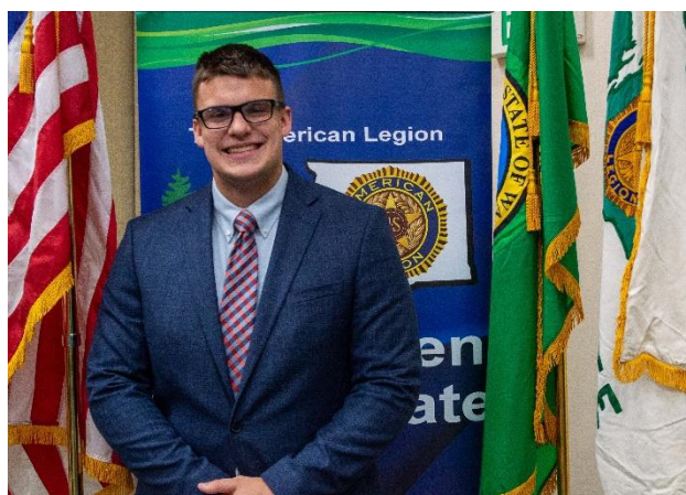
Governor Sam Petersen (Post 127) | (Lakeside H.S.)