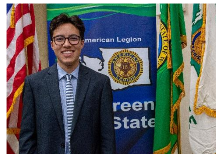
State Treasurer Grant Shinohara (Post 172) | (Bainbridge H.S.)

Color photos, a complete annual and planning resources for 2020 are available at: