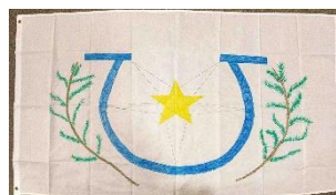
Cedar's City Flag