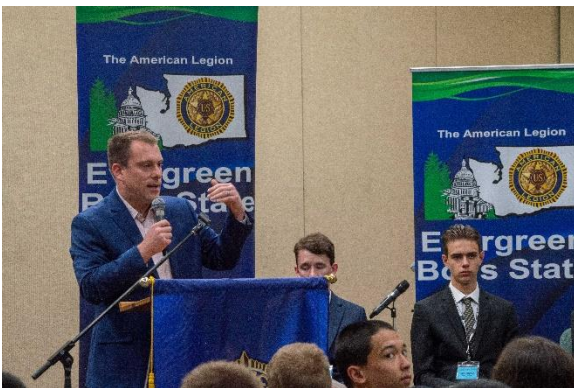
Evergreen Boys State Alumni from 2002