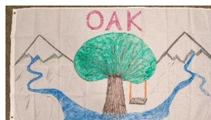
Oak's City Flag