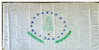
Juniper's City Flag