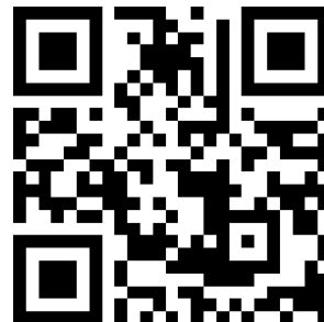
Dietary Needs Form